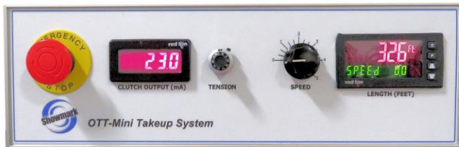
The easy-to-use OTT-Mini control panel can include Tension, Length, and Linear Speed readouts

Options include: Electronic tension control, length tracking, linear speed readout, wire break detection, Left-to-Right or Right-to-Left operation.