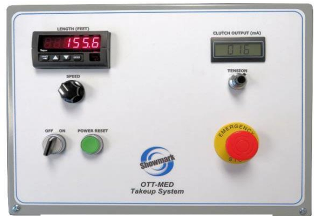
Typical example of a control panel for the OTT-Med or OTT-Max